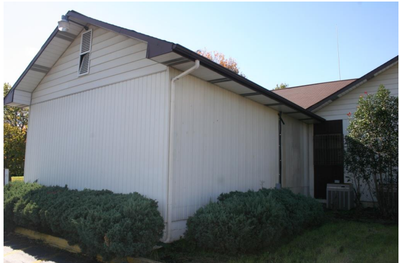
Special addition to the building to house communication