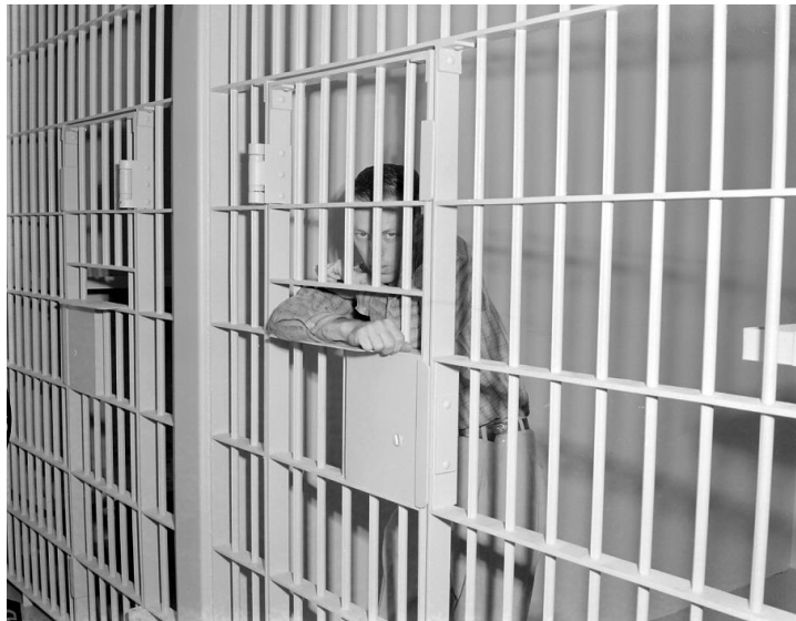
Ed Westcott poses as a "jail bird"

We learned that the Oak Ridge Police Department remained in 101 Bus Terminal Road after the Security Forces moved out. In fact, ORPD used that building until their present facilities at the Oak Ridge Municipal Building became available. However, the first Oak Ridge Jail was not located at 101 Bus Terminal Road at all. It was located at the Town Hall near Jackson Square.