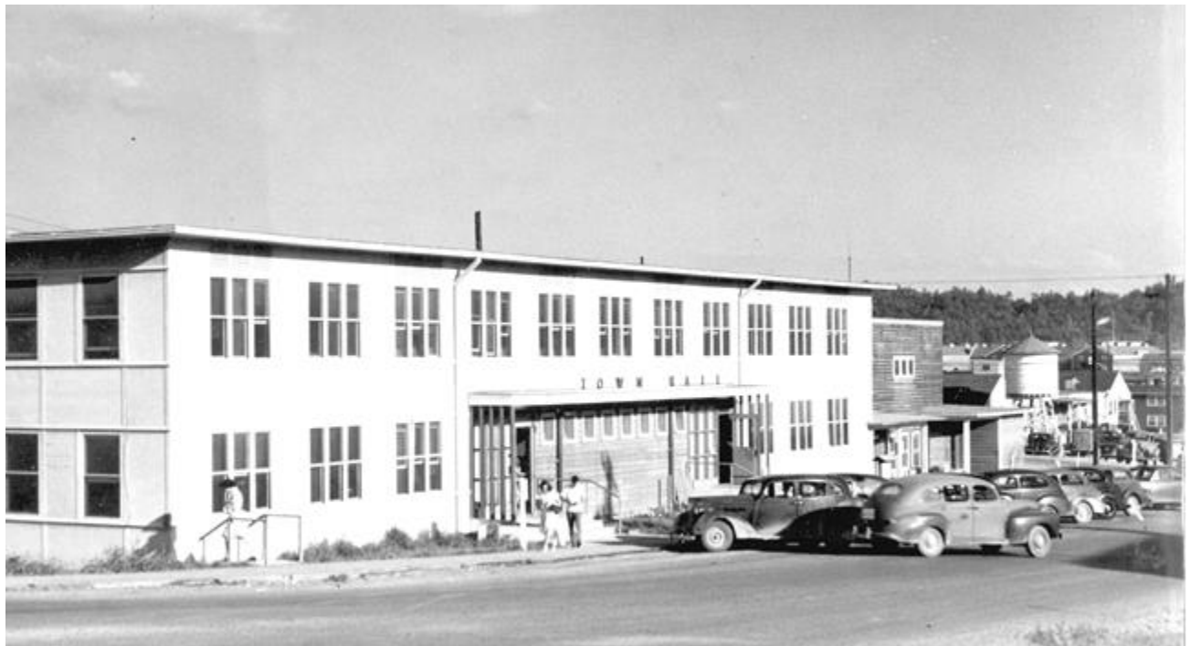
The first site of the Oak Ridge Jail

Now let's look at the connection from Building 9213 and 101 Bus Terminal Road. Bill Sergeant said that the portion of the building commonly mistaken as a "jail" was first built as a security communications center linked by radio to Building 9213, just south of the ridge beyond Y-12. The concern they had at the time was that an attack would be made to capture the enriched uranium stored in Building 9213's vault and they wanted the security forces to know of such an attack immediately. They also wanted the security forces headquarters to be safe from attack so, the one-foot thick concrete ceiling, no windows, and heavy concrete construction of the addition to 101 Bus Terminal Road.