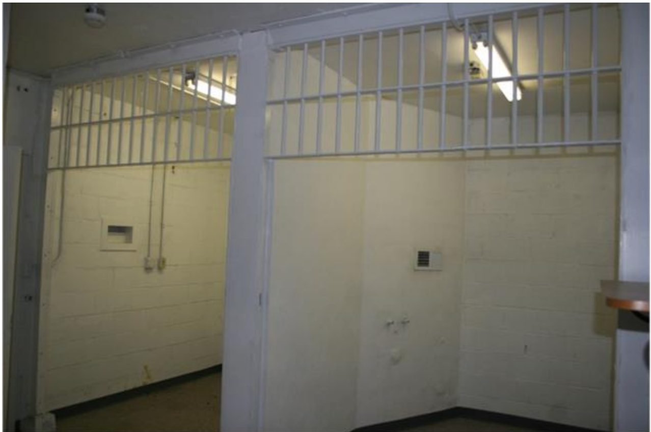
Jail cells obviously modified after the communications center was no longer used