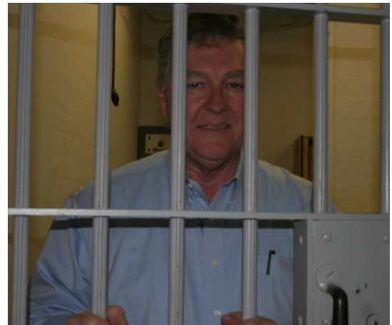
I couldn't resist—self-portrait in first Oak Ridge jail