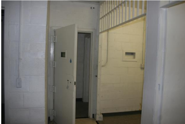
Heavy door and jail cells

The heavy door, mentioned by Ben Andrews as the “one remaining door” isolates the two cells from the rest of the building. The cells themselves are only about 10 feet by 10 feet each. There are two of them.