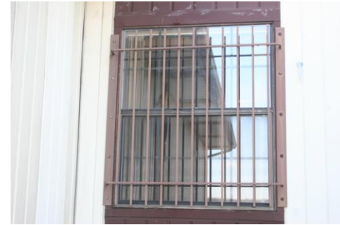
Window in hallway with exterior bars

There is located in the addition a strange arrangement of two small rooms with bars at the top and obvious places for the jail doors on each of the small rooms. The area has a very strong and heavy door leading from the hallway to the two cells. There is a small opening that serves as a pass-through the wall that looked to me only suitable for passing mail or small items such as books or newspapers. It was in the wall between the hallway and the first cell. There was no way for such a pass through to the second cell.